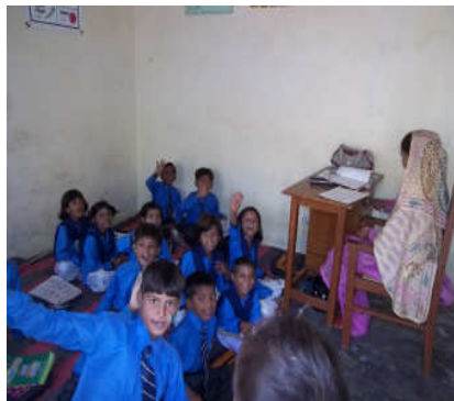
1 st & 2 nd grade with teach