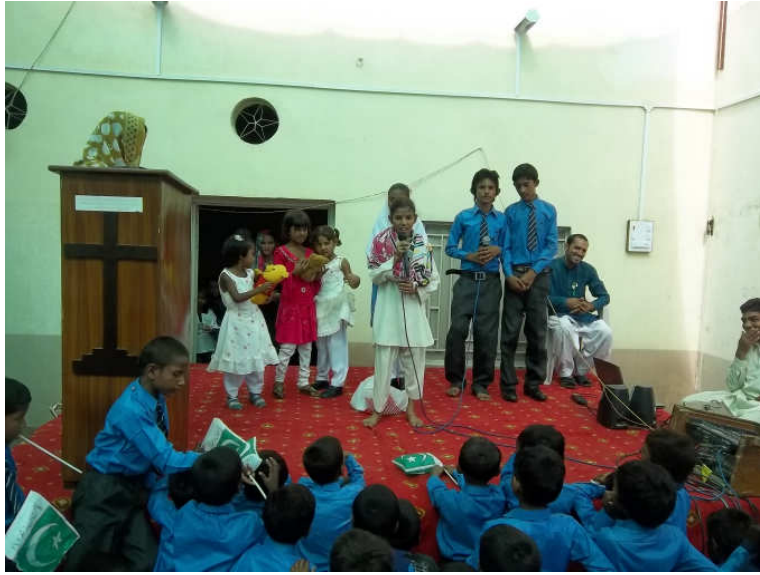
Actors in the play

The children also put on a play. The play was about a very poor family who received the grace blessing of having their children attend GBC Pakistan School. Over time the father converted and changed his ways, and the entire family was blessed.