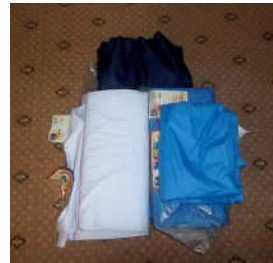
Material for uniforms for the girls