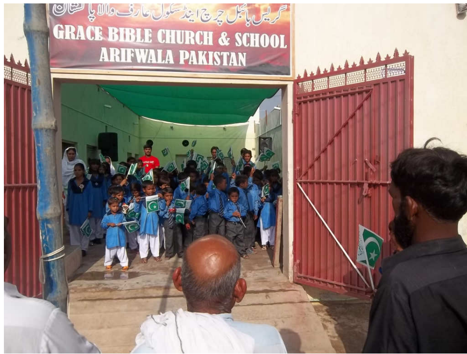
Singing national independence song

On August 14 th , Pakistan celebrated 64 years of independence from British rule. Although it was the first day of school, the day was spent in celebration. The children and families sang national songs, danced with the songs, sang Christian songs, and the church provided various desserts for them to enjoy.