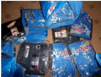
Uniforms for the boys from the market

We were blessed with a donation of purchased uniforms for the boys and material for the uniforms for the girls. We provided the families with materials so they could sew the uniforms for their daughters. We and the parents are very thankful for these grace provisions.