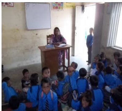
Pre-school with teacher

School days run from 7:45 am – 12:45 pm. This year we are starting the school day with Bible study followed by all the academic classes. We had 87 children in attendance the first day.