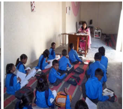
3 rd & 4 th grade with teacher