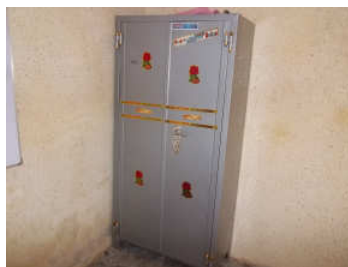
We were also blessed with a new cabinet to store the school supplies