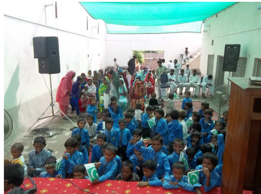
Parents watching their children in comedy skit

The children also put on comedy skits. The staff received very positive feedback from the parents and children.