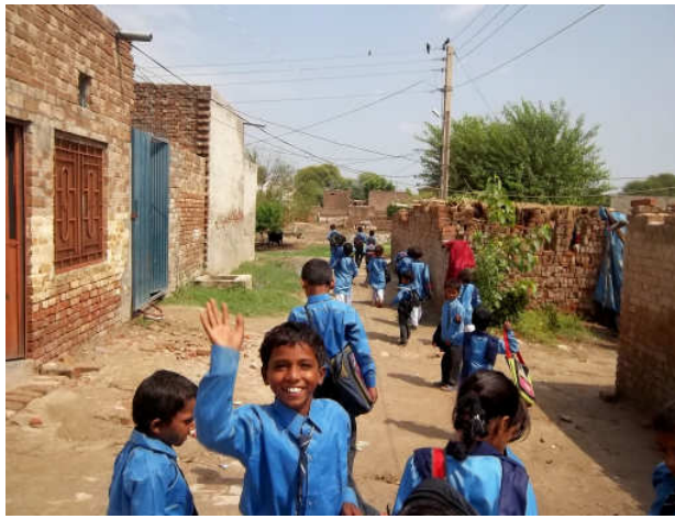
Children leaving after their first day of school

Col 3:17 What ever you do in word or deed, do all in the name of the Lord Jesus, giving thanks through Him to God the Father.